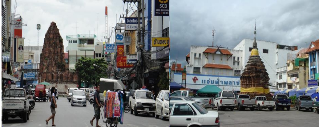
Figure 4: Left: Pagoda in Lapburi, Right: Pagoda in Lumphon